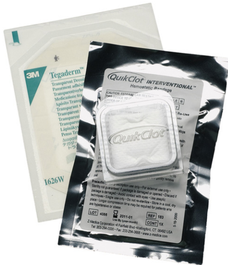
Fig. 1. QuikClot Interventional Bandage.

access site and cover it with a non-compressive dressing; 4) check the groin at 15 min, 1, 4 and 12 h; and 5) allow the patient to ambulate four hours after hemostasis achievement.